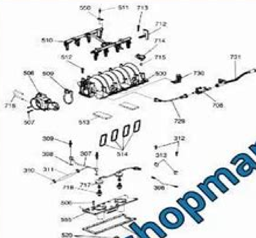
Fig. 11: Intake Manifold Upper Component View Courtesy of GENERAL MOTOR CORP.