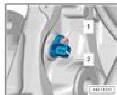
Fig. 141: Identifying Rear Shock Sensor