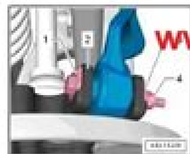
Fig. 142: Identifying Key T40049 At Rear On Cranksh.

-- Remove coil spring. Refer to (2001-2002).