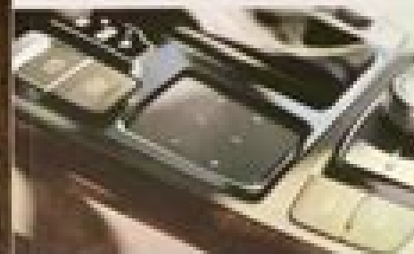
MMI Navigation plus Operating Instructions