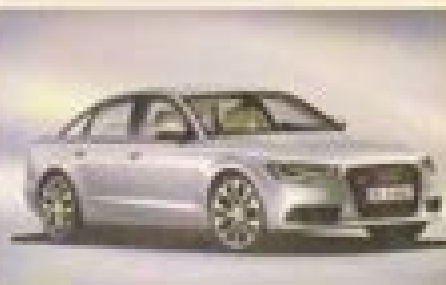
2013 Audi A8 Owner's Manual