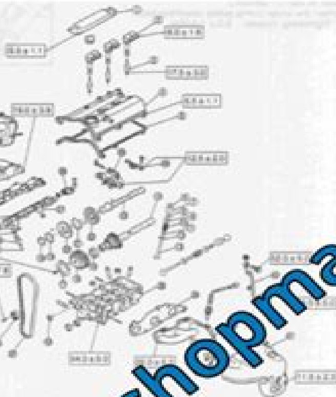
Timing torque 8.5 Nm

88011 88012 88013 88014 88015 88016 88017 88018 88019 88020 88021 88022 88023 88024 88025 88026 88027 88028 88029 88030 88031 88032 88033 88034 88035 88036 88037 88038 88039 88040 88041 88042 88043 88044 88045 88046 88047 88048 88049 88050 88051 88052 88053 88054 88055 88056 88057 88058 88059 88060 88061 88062 88063 88064 88065 88066 88067 88068 88069 88070 88071 88072 88073 88074 88075 88076 88077 88078 88079 88080 88081 88082 88083 88084 88085 88086 88087 88088 88089 88090 88091 88092 88093 88094 88095 88096 88097 88098 88099 88100