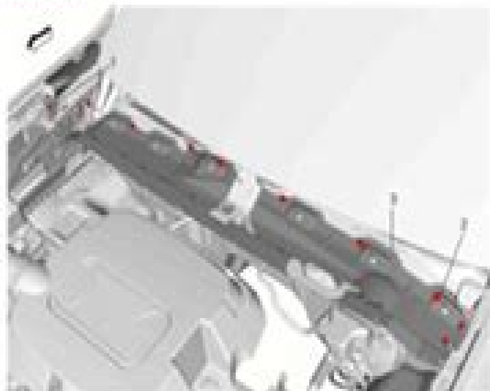
Fig. 23. Plenum Front Panel