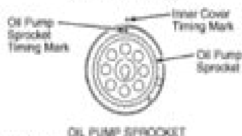
Fig. 5: Aligning Camshaft & Oil Pump Timing Marks