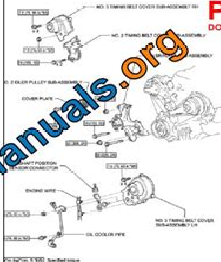
Fig. 18: Identifying Engine Unit Replacement Components With Torque Specifications (if O.I.D.)