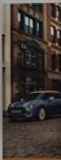
QUICK REFERENCE MINI HARDTOP 2 DOOR