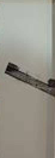
TIRE MANUFACTURER WARRANTIES GUIDE