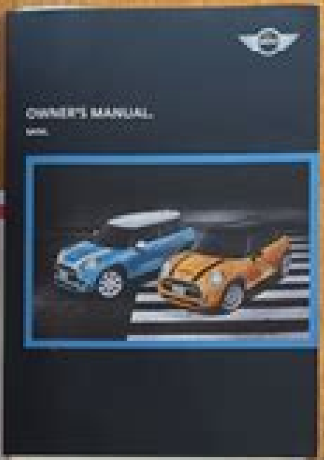
OWNER'S MANUAL 2014