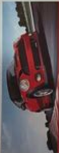
COME GET SCHOoled BY THE PROS IN THE CLASSROOM AND ON THE RACETRACK AT THE MINI MOTORING SCHOOL