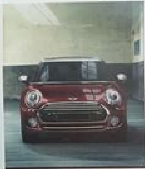
MINI FINANCIAL SERVICES LIMITED WARRANTY 2015-2016