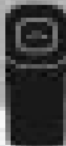
Headset case (optional)