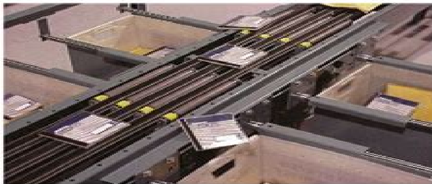
NBS90 SP (Small Parcels)