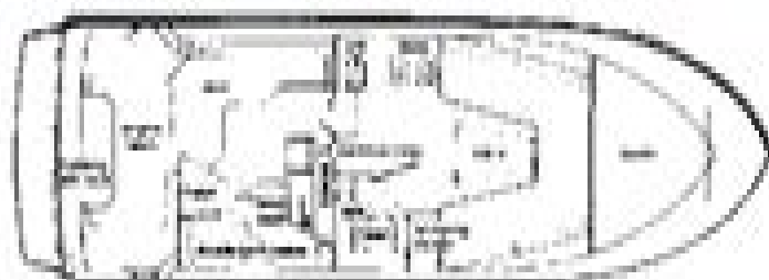
Contessa Floorplan (1983-87)

Bayliner has had its share of popular boats over the years, and the 2850/2855 Ciera Sunbridge was certainly one of them. Introduced in 1983 as the 2850 Contessa Sunbridge (and becoming the 2855 Ciera Sunbridge in 1988 when the floorplan was updated), she was marketed as a budget-priced family cruiser with sleek styling, a wide beam, and a spacious midcabin layout. This is a roomy boat below for a 28-footer with good headroom thanks to her raised foredeck and elevated helm. Berths for six are provided together with a standup head compartment, decent counter space, and a full-size galley. The cockpit has plenty of lounge seating for guests, and visibility from the helm position is excellent. When she became the Ciera Sunbridge in 1986 the deckhouse was re-designed and raised slightly, and the interior was completely rearranged with a U-shaped dinette to port replacing the previous dinette forward. Built on a lightweight hull, most were sold with a single 260hp Volvo sterndrive engine. She'll cruise easily at 18 knots and reach a top speed of 26-27 knots. Note that several subsequent 2855 Ciera Sunbridge models were produced by Bayliner.