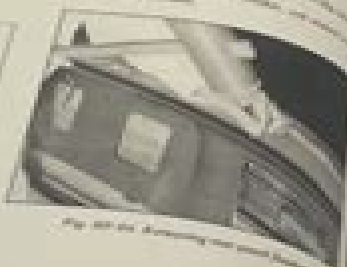
Fig. 30-41. Removing rear panel from battery.