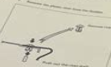
Fig. 30-40. Removing plastic cover.

Fig. 30-40. Removing plastic cover. 1. Remove the plastic cover from the battery.