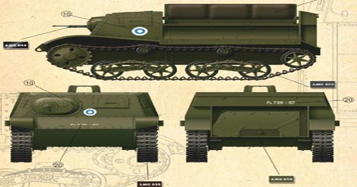
Mod. 1938 Finnish Army