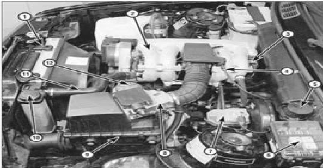
Underbonnet view (left-hand side) of a UK model 318i (1988)