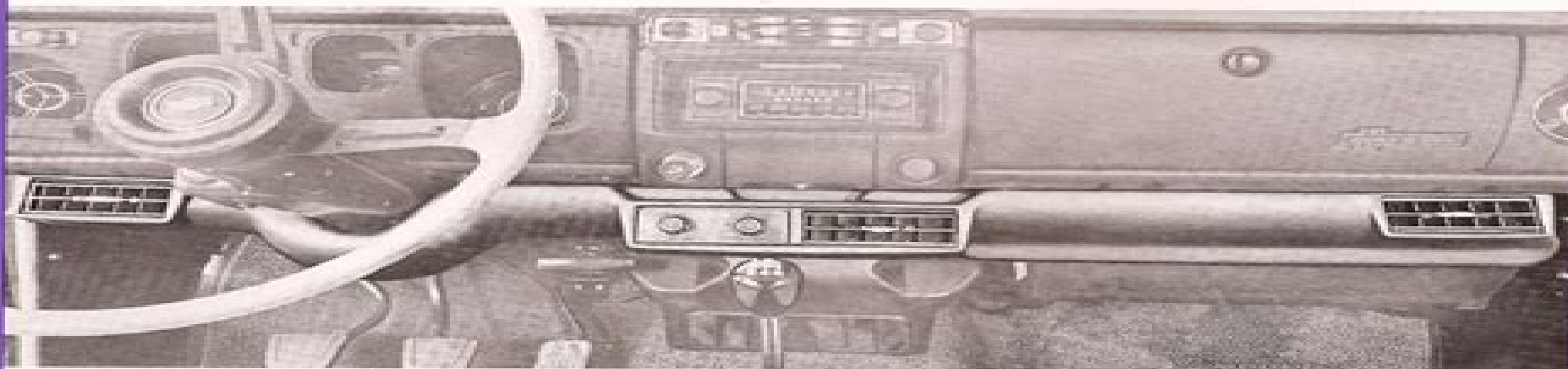
AIR CONDITIONER — PART NO. 99990—00213

You'll always be on time with this quality accessory from DATSUN. Stylish electronic clock has white numbers on a black background for easy visibility. The clock comes ready to plug into the existing wiring harness, easy to install and so convenient. Complement the dashboard of your DATSUN 510 with this timely accessory.