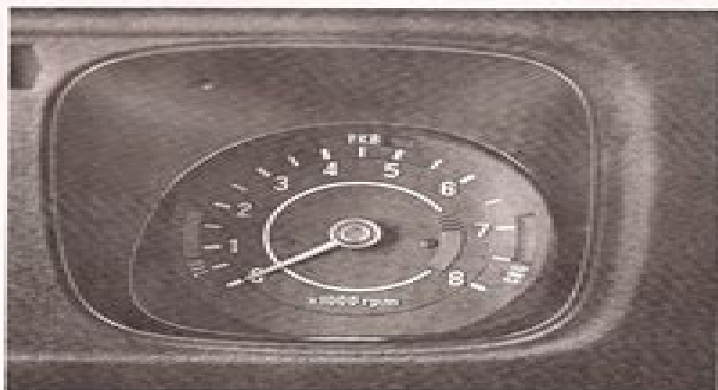
TACHOMETER — PART NO. 24855—N0800 TACHOMETER HARNESS — PART NO. 24158—A5400

The best bet yet for developing peak performance in DATSUN's 510 engine is this quality electronic tachometer. The DATSUN tachometer is ideal for the sports rallyist or the concerned motorist who wants to get the most out of gas mileage and engine life. Fits right next to the speedometer allowing easy viewing of speed and engine rpm's. The DATSUN tachometer plugs into the tachometer harness which must be ordered separately.