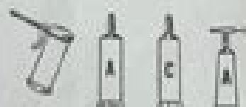
OMC TYPE "A" TYPE "C" DRAIN OIL