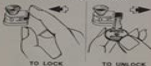
CHILD GUARD DOOR LOCK

CHILD-GUARD DOOR LOCKS (dealer installed): The cost of the unit from your dealer is nominal for the protection obtained. Your adult passengers should be advised of the operation of this device so that they will not be confused when trying to leave the car.