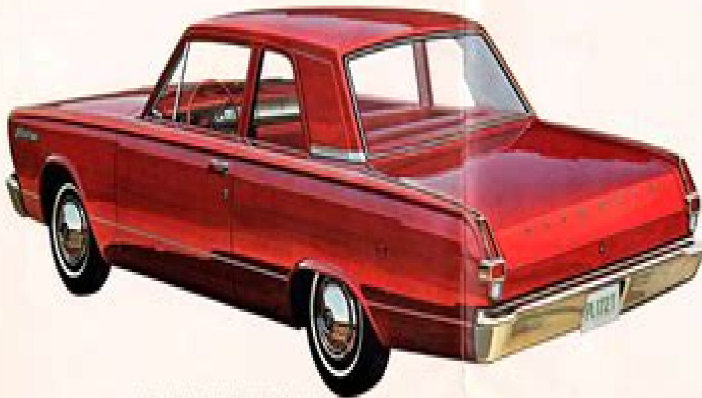
Student ID: _____ Name: _____ Section: _____