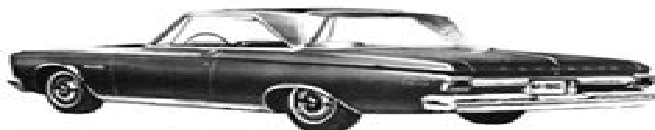
SATELLITE TWO-DOOR HARDTOP