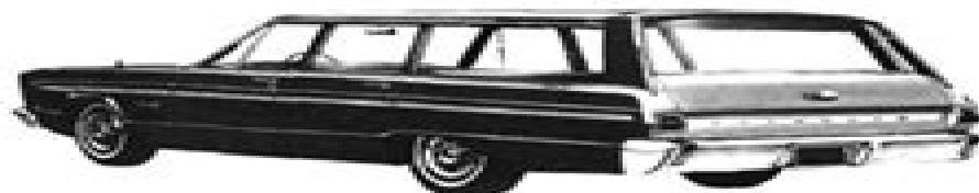
FURY II STATION WAGON