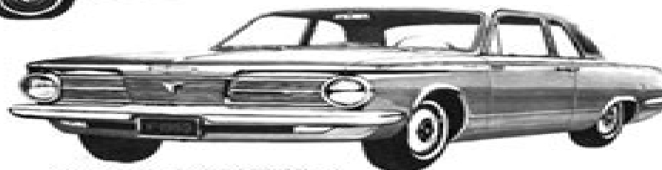
VALIANT 200 TWO-DOOR SEDAN