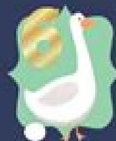
GEESE 'A LAYING