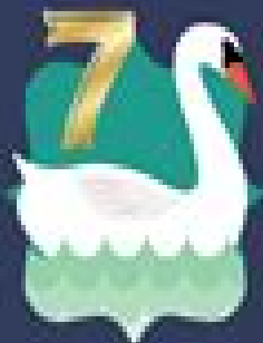
SWANS 'A SWIMMING