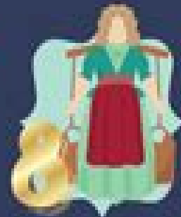
MAIDS 'A MILKING