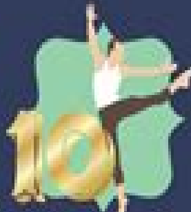
LORDS 'A LEAPING