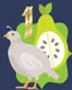
A PARTRIDGE IN A PEAR TREE