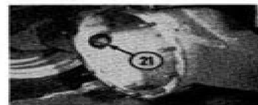
Fig. 11—When removing axle use caution not to damage the oil seal (21) shown. Differential and carrier hubs have been removed for clarity.