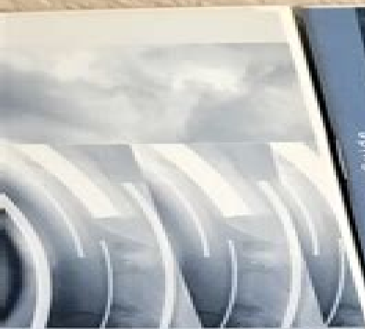
TYRE WARRANTY GUIDE

2010 model year Scheduled Maintenance Guide