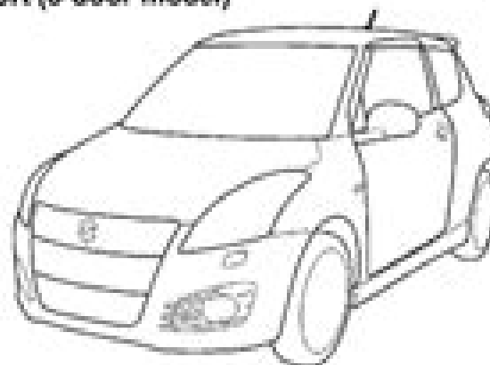
SWIFT Sport (3-door model)