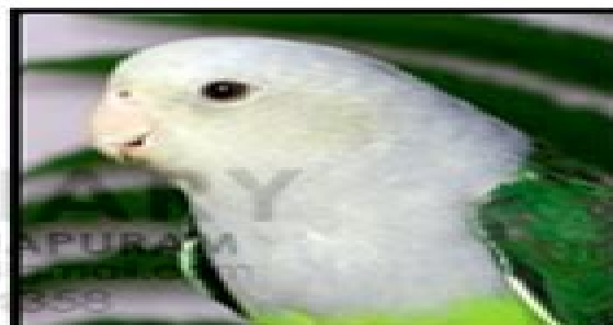
MADAGASCAR LOVEBIRD AGAPORNIS CANUS