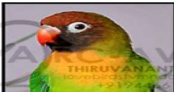
BLACK-CHEEKED LOVEBIRD AGAPORNIS NIGRIGENIS