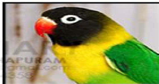
MASKED LOVEBIRD AGAPORNIS PERSONATUS