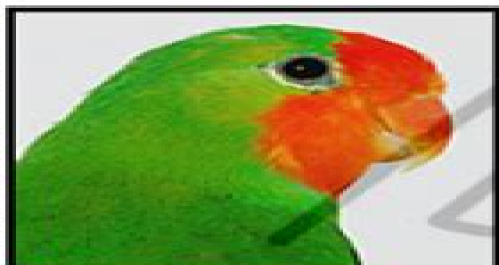
RED-HEADED LOVEBIRD AGAPORNIS PULLARIUS