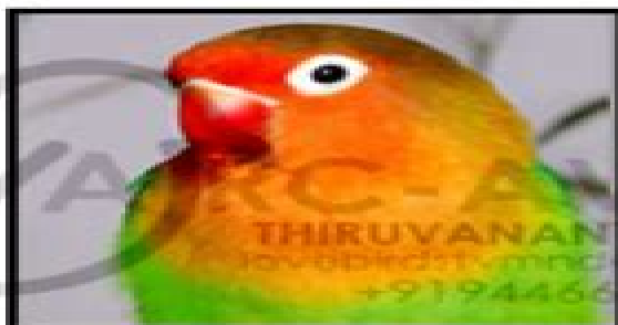
FISCHER'S LOVEBIRD AGAPORNIS FISCHERI