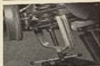
Fig. 1-2. Adjusting the self-aligning steering knuckle.