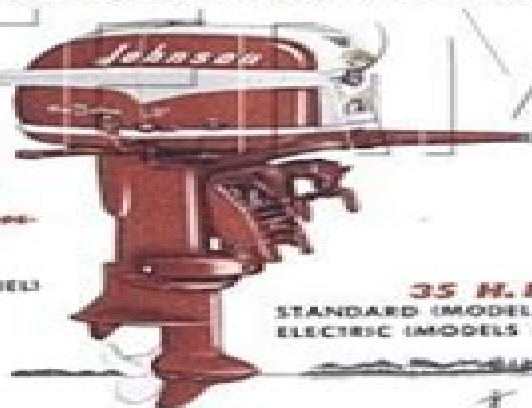
35 H.P. STANDARD (MODELS RD & RDU) ELECTRIC (MODELS RDE & RDEU)