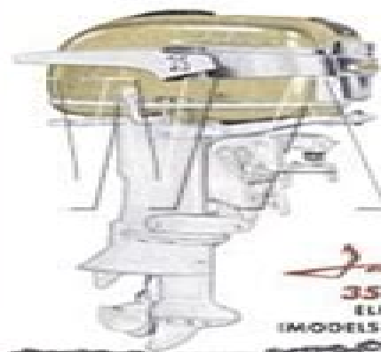
Invincible 35 H.P. ELECTRIC (MODELS RJE & RJEU)

12 VOLT STARTING (ELECTRIC MODELS) QUICK DISCONNECT BATTERY LEADS CHOKE STOPPING PROTECTS YOUR MOTOR