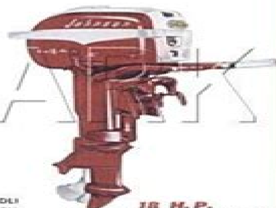
18 H.P. STANDARD (MODELS FD & FDU) ELECTRIC (MODELS FDE & FDEU)