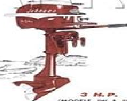
3 H.P. (MODELS JW & JWU)