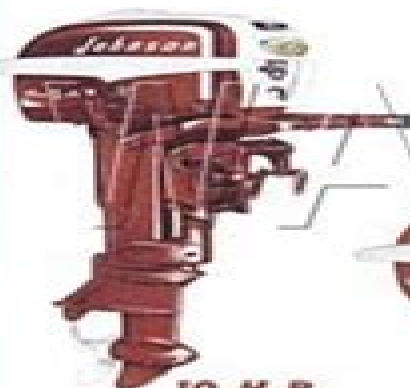
10 H.P. (MODELS OD & ODU)