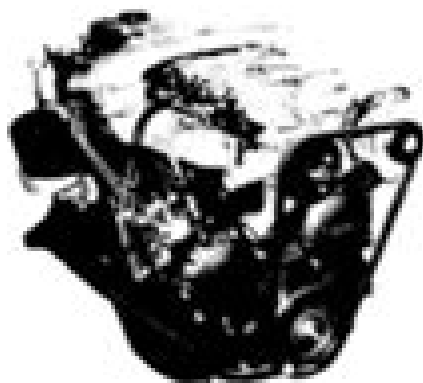
Vistas exteriores del motor 11Z