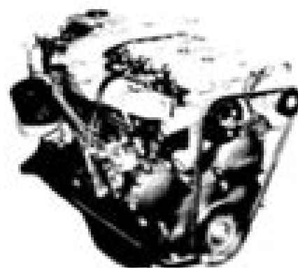
11Z Engine Exterior Views