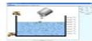
Salts & Solubility

When we cook pasta, we frequently dissolve table salt in water. Is there a limit to how much salt we can get into the water? When ionic-bonded compounds (like table salt, NaCl) are dissolved in polar solvents (like water), the polar water molecules act to pull the ions in the compound apart. When this happens (called dissociation), ions are released into the solution. Is there a limit to the number of ions that can exist in solution?