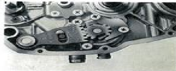
Fig. 6-8-4. Fitting gear shifting shaft arm

When fitting the gear shifting forks on the fork shaft, make sure that each fork is mounted in the correct direction as shown in Fig. 7-8-5