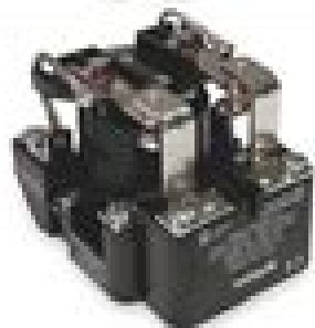
30-40 Amp open-frame relay