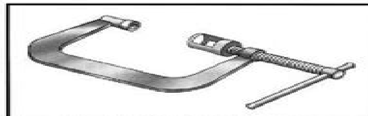
Figure 3-62. Valve Spring Compressor (Part No. HD-34735B)