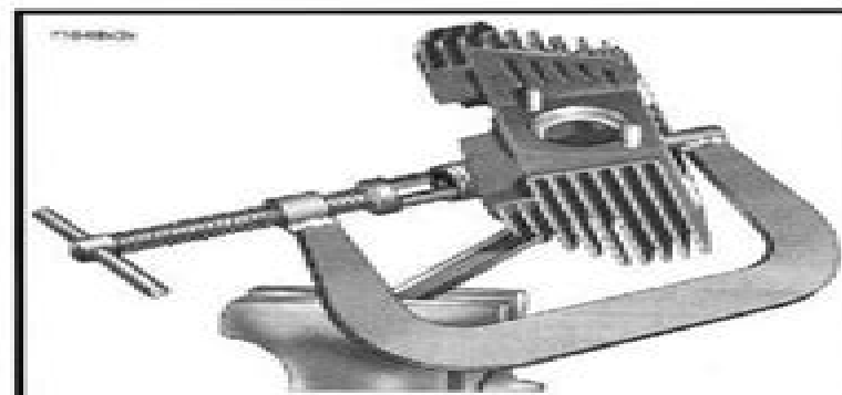
Figure 3-63. Compress Valve Springs