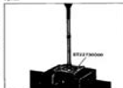
Fig. TB-22 Removing main drive bearing

16. Remove the main bearing from the main shaft by the use of a bearing puller (special tool BT-22100000) and a press.