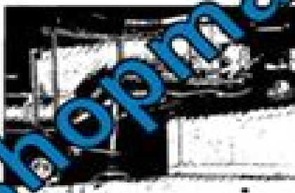
Fig. EB-13 Removing vehicle control rod

12. Remove the front engine mounting insulator bolts.