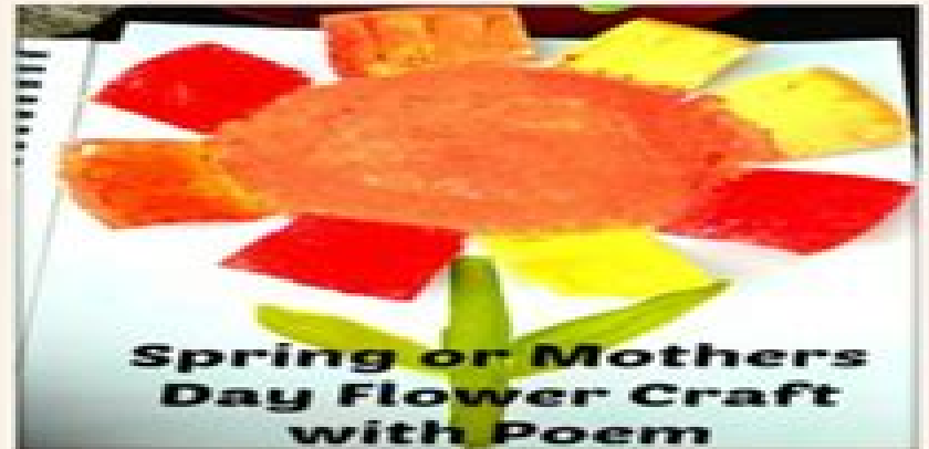
Spring or Mothers Day Flower Craft with Poem