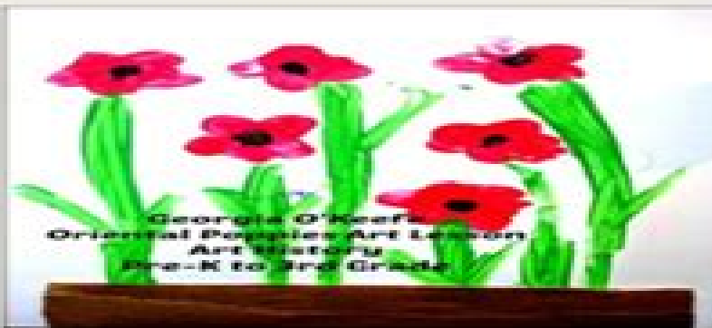
George O'Keefe Oriental Poppies Art Lesson Art History Pre-K to 3rd Grade