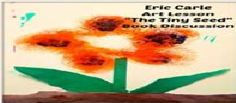
Eric Carle Art Lesson "The Tiny Seed" Book Discussion