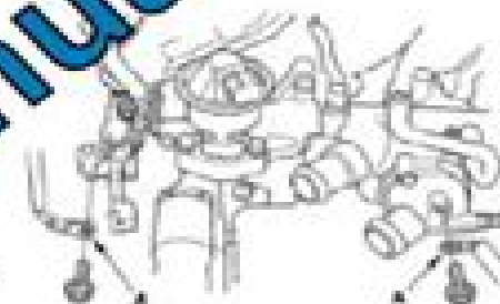
Fig. 24: Identifying Ground Cables Courtesy of AMERICAN HONDA MOTOR CO., INC.

J35A6 and J35A7 engines: Remove the ground cables (A).