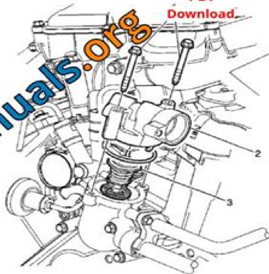
Fig. 55: Engine Coolant Thermostat (LLT) Courtesy of GENERAL MOTORS CORP.

Install the oil cooler M8 (1) and M6 (3) bolts. Tighten the M6 bolts to 10 Nm (89 lb in). Tighten the M8 bolts to 25 Nm (18 lb ft).