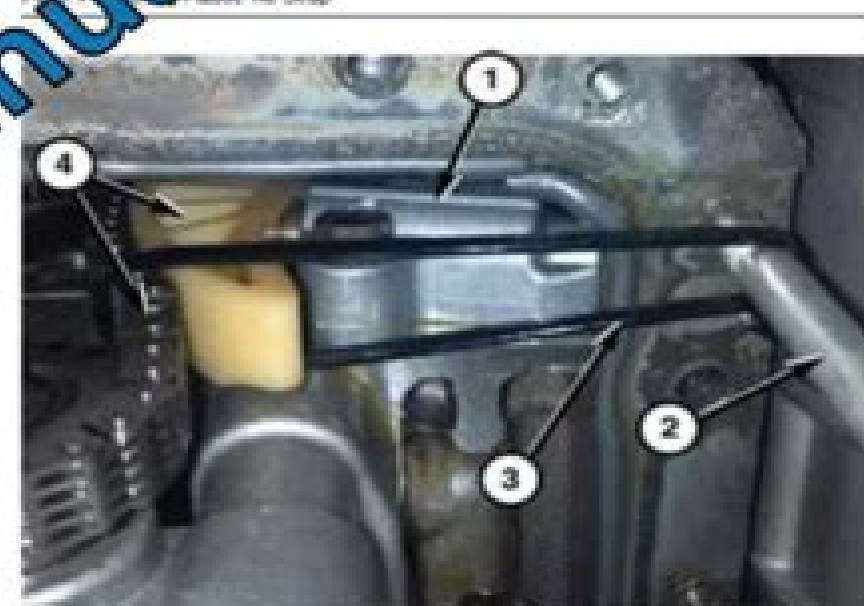
Fig. 5. Water pump pulley, adjuster and locknut