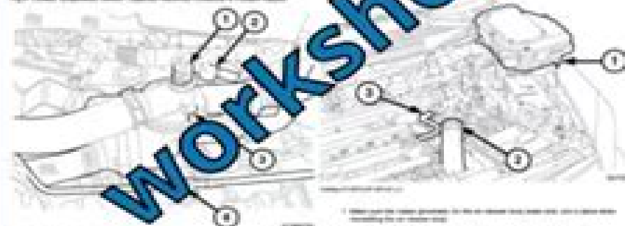
Fig. 2. Water pump pulley, adjuster and locknut