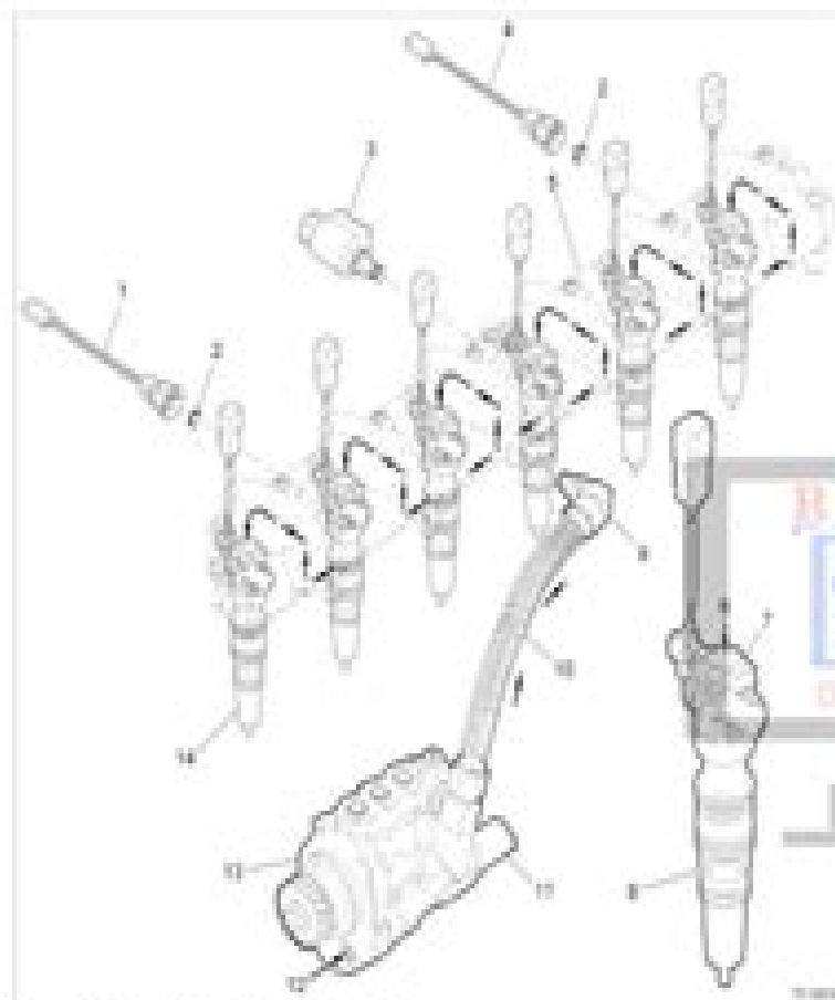
Figure 17 Injection Control Pressure (ICP) system