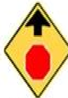
Stop Sign Ahead sign