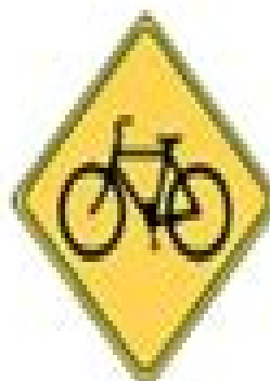
Bicycle Crossing sign