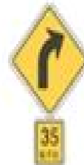
Advisory Speed Around Curve sign