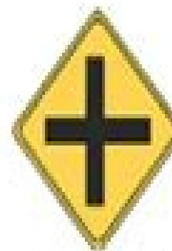
Cross Road Ahead sign