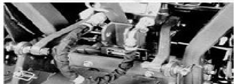
Slide No. 7 Rear Hyd Kit