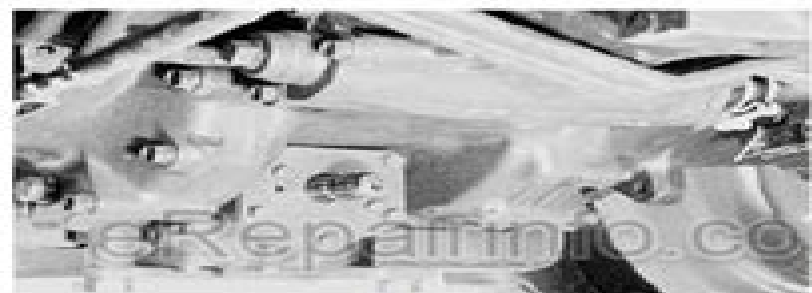
Slide No. 6 Mid-PTO