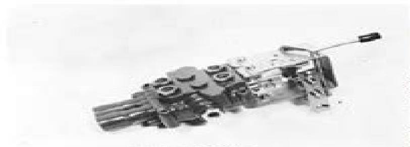
Slide No. 5 SCV Lever