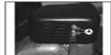
Figure 24: Diagram showing the connection of the battery to the engine's electrical system.