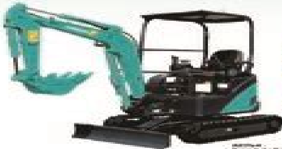
ART10u-4MAX Total Weight: 980kg Bucket Capacity: 0.022m³