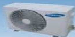
AQ12EWGN(X)SER AQ09ESGN(X)SER AQ12ESGN(X)SER