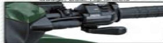
Thumb Throttle and 2WD and 4WD Selector