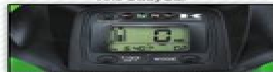
Digital Meter, Features Clock and Fuel Gauge, Dual Trip Meters