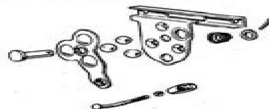
Clutch operating mechanism