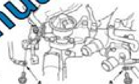
Fig. 24: Identifying Ground Cables Courtesy of AMERICAN HONDA MOTOR CO., INC.

J35A6 and J35A7 engines: Remove the ground cables (A).