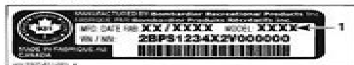
TYPICAL — VEHICLE IDENTIFICATION NUMBER LABEL 1. Model number