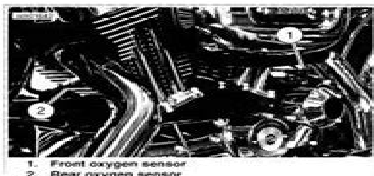
Figure 4-66. Oxygen Sensor Locations, typical (XL model shown)

Refer to the electrical diagnostic manual for information on the function and testing of the O 2 sensors.