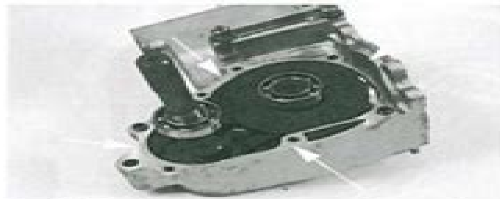
Apply Crankcase Sealant to mating surfaces.