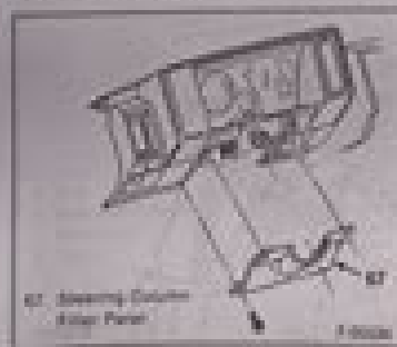
Figure 3—Steering Column Filter Panel