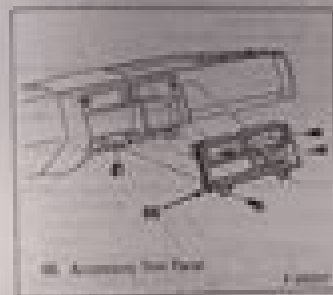
Figure 6—Accessory Trim Panel