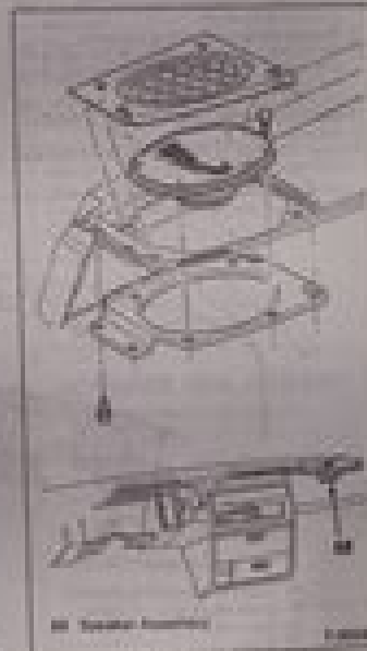
Figure 7—Radio Speakers