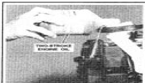
Fig. 45 In both cases, check the oil EVERY outing and add when necessary

present, you'd do well to discover the source. What gremlin is sneaking onto your boat at night, opening the cap and putting them there?